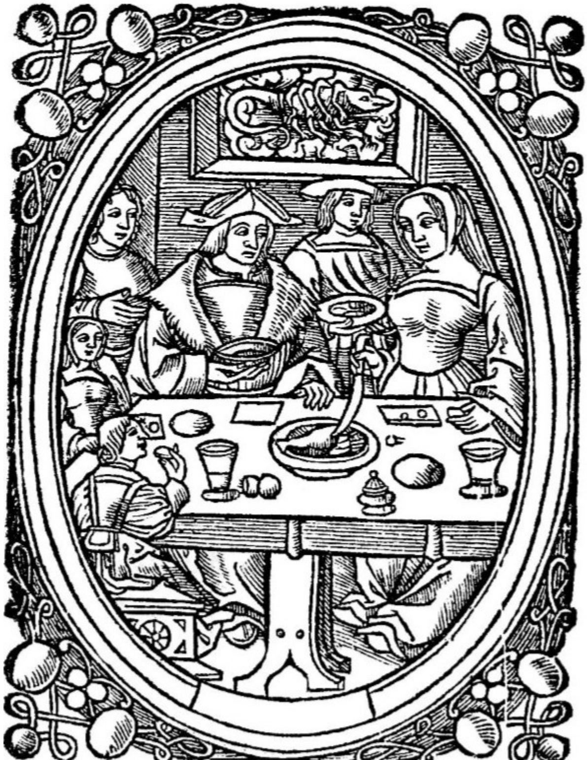
Heures De nostre dame a lusaige Dangers , 1545, Res. ST 0501