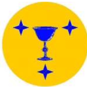
Star of Djulke (Award for Exemplary Contribution to Service and Culture): Or a goblet azure encircled by three 4-point mullets azure.