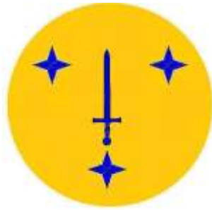
Award of Perseus (Rapier Award): Or a sword palewise azure encircled by three 4-point mullets azure.