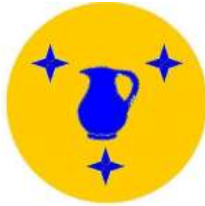
Star of Hroar (Award for Exemplary Contribution to A&S): Or a jug azure encircled by three 4-point mullets azure.