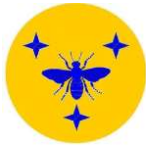
Award of Apis (Service Award): Or a bee azure encircled by three 4-point mullets azure.